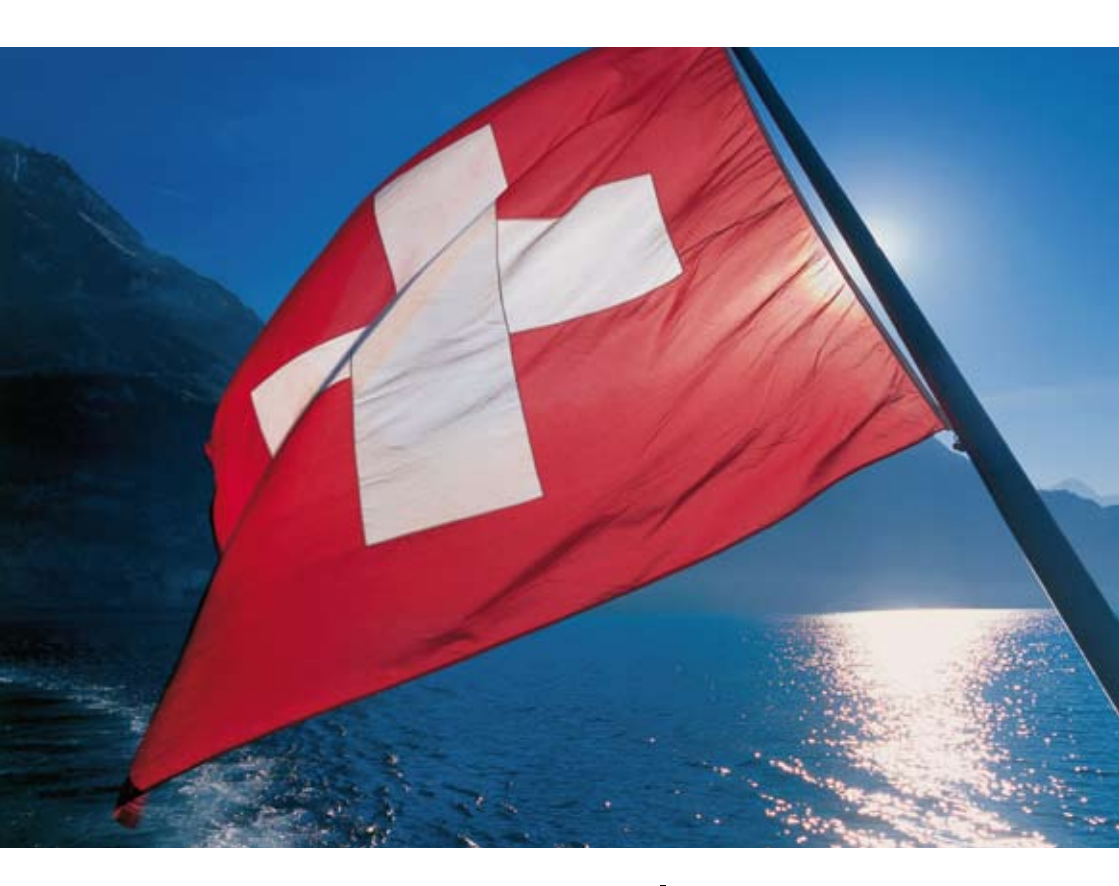
swissôtel Düsseldorf / Neuss